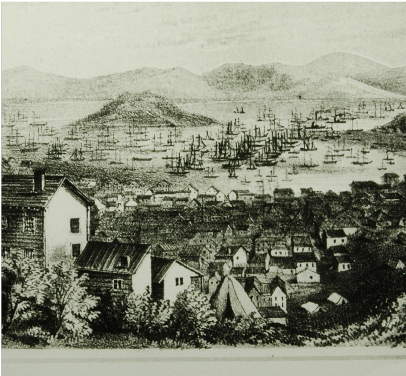
San Francisco, California in November 1849

Whether traveling to California by walking, covered wagons , or boats, people needed to buy food, supplies, and other items once they arrived in these towns. Many new businesses started to provide products (items for sale) and services (activities for sale that help others) to the people living in California. A number of the businesses that started during the California Gold Rush, such as Levi’s Jeans and Wells Fargo Bank, are still around today. As less and less gold was found, people started leaving these towns. Some boomtowns quickly became ghost towns , while others such as San Francisco and Sacramento are still big cities today. In the end, very few gold miners became rich from finding gold. The people who ended up making a lot of money during the California Gold Rush were the people who sold different products and services to the gold miners.